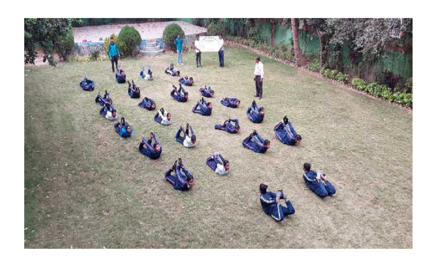
Celebration of International Yoga Day on 21st Juine'2018