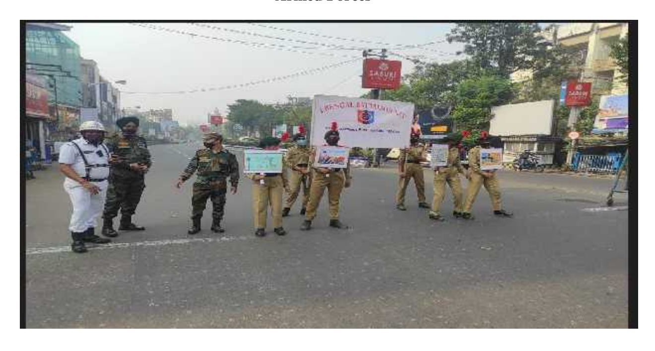
Participated in "Safe Drive and Save Life" Programme on 16/12/2021