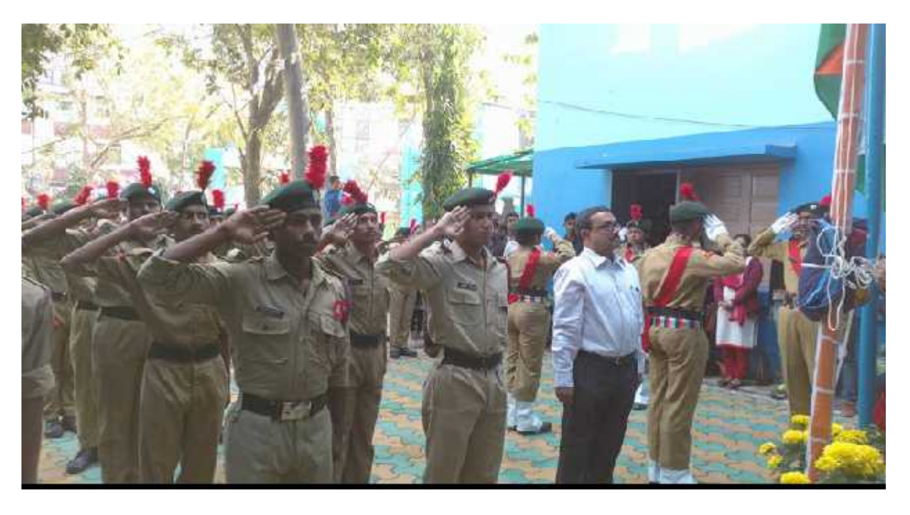
Celebration\ of\ Republic\ Day-2018