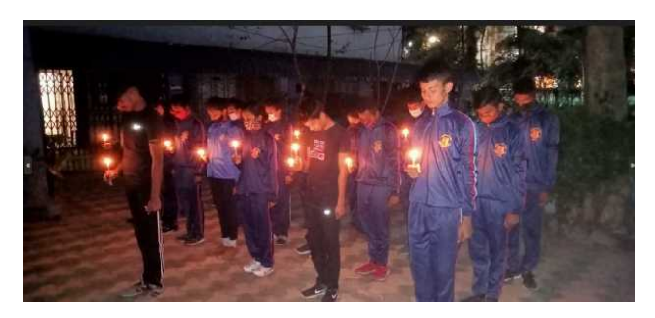
Tribute to the Forces of Pulwama Attack by Candle Procession on 14/02/2019