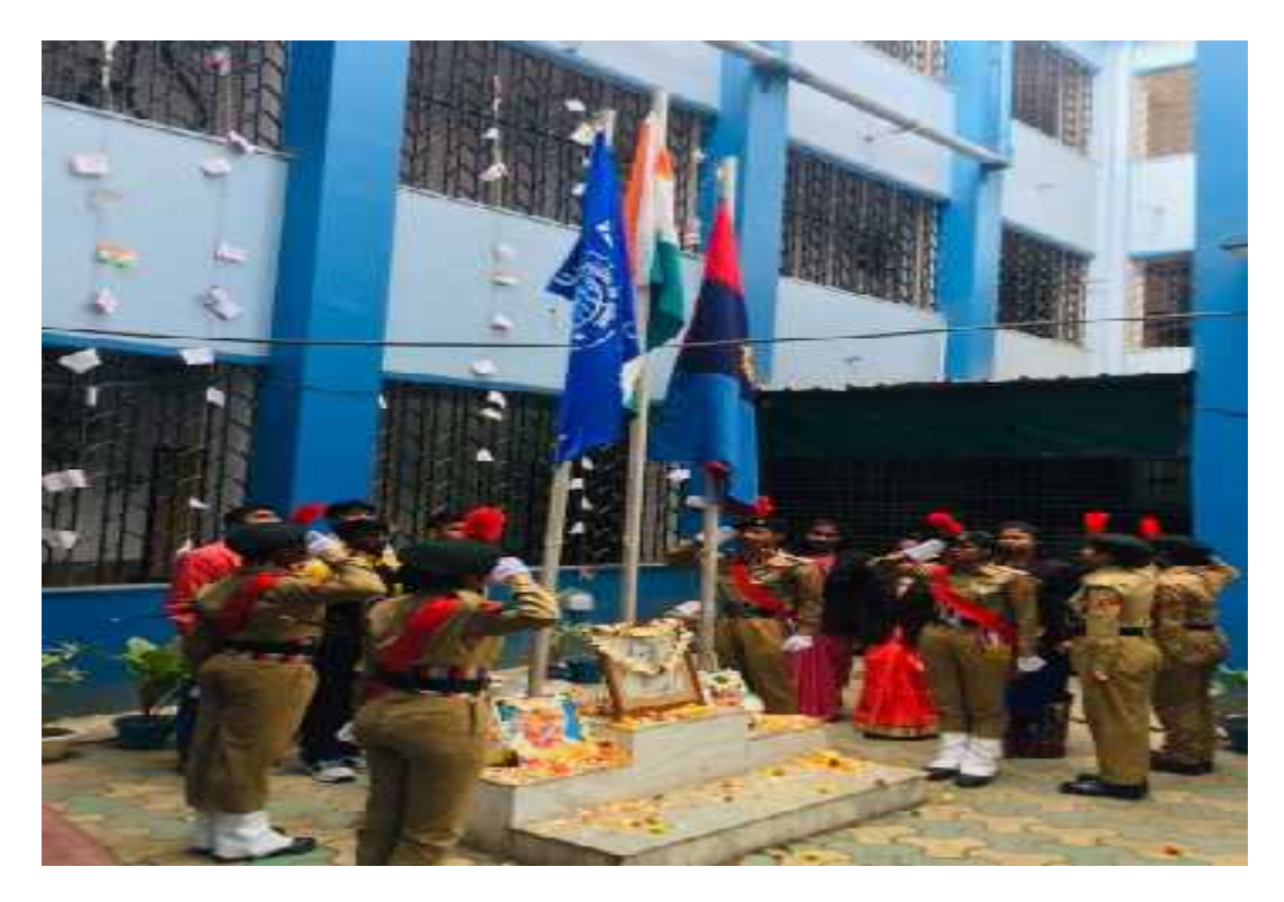
Celebration \ of \ Republic \ Day-2020