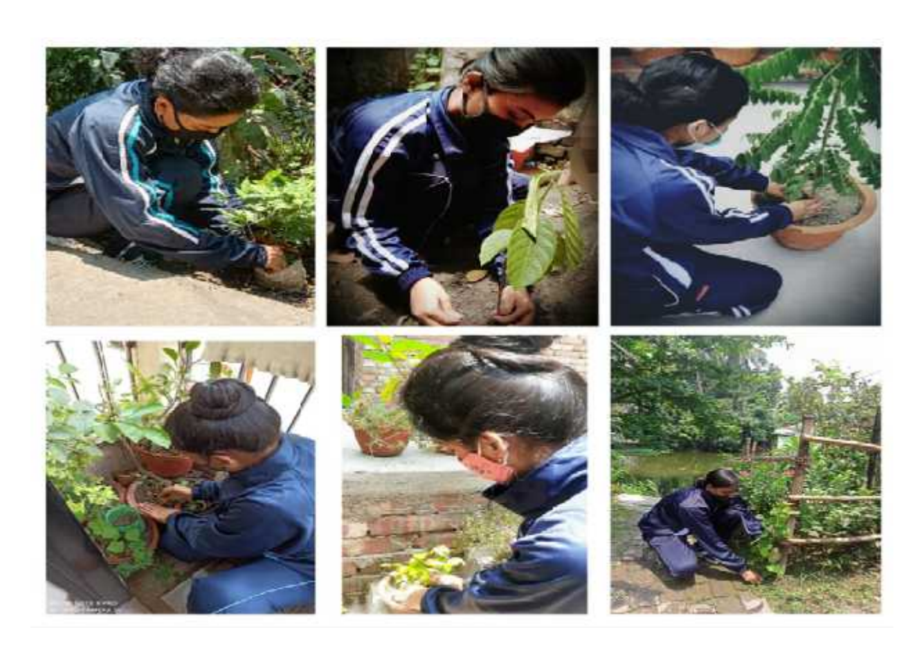
Celebration of Van Mahotsav in the COVID - 19 Pandemic