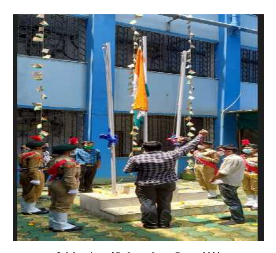
Celebration \ of \ Independence \ Day-2020