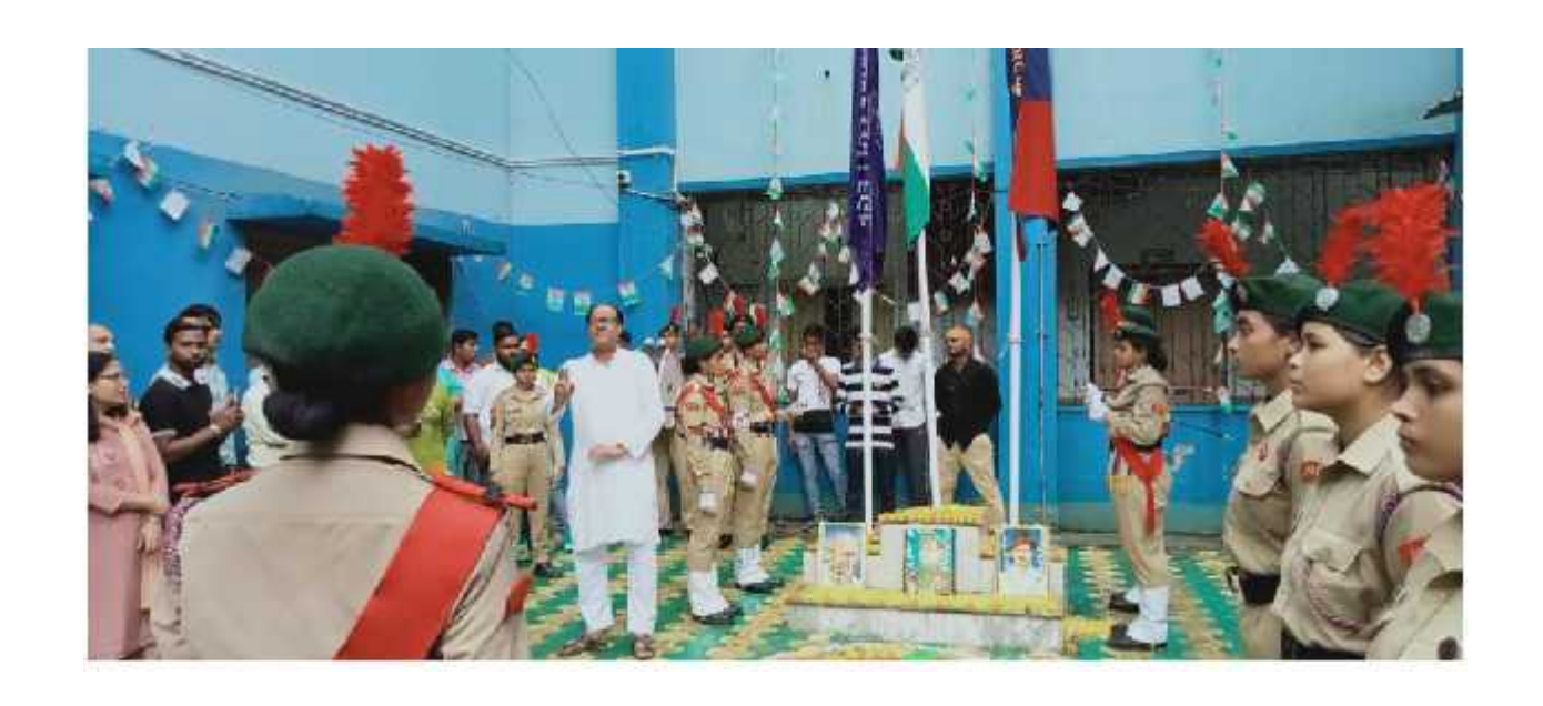
Celebration \ of \ Republic \ Day-2022