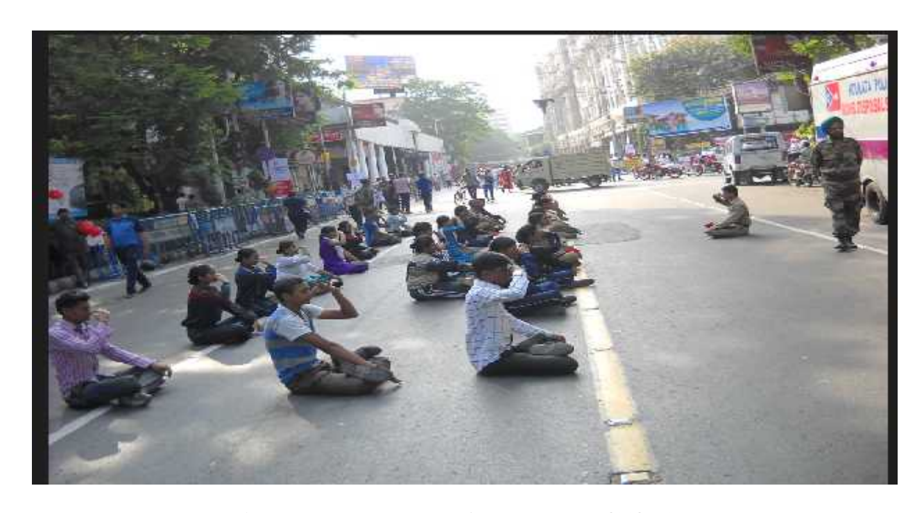
Awareness Programme for Yoga on 05/11/2017