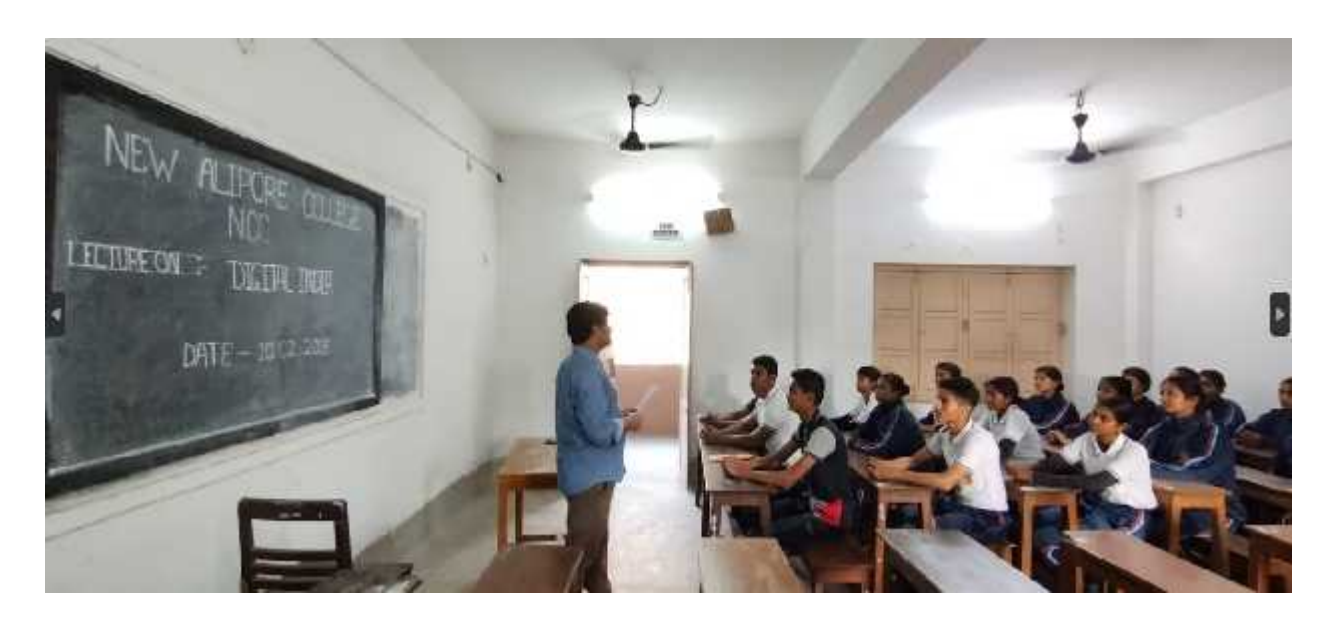
Awareness Programme on DIGITAL INDIA (10/02/2018)