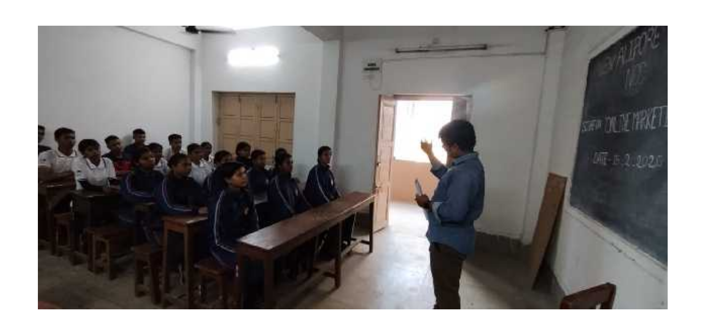
Awareness Programme on ONLINE MARKETING (15/02/2020)