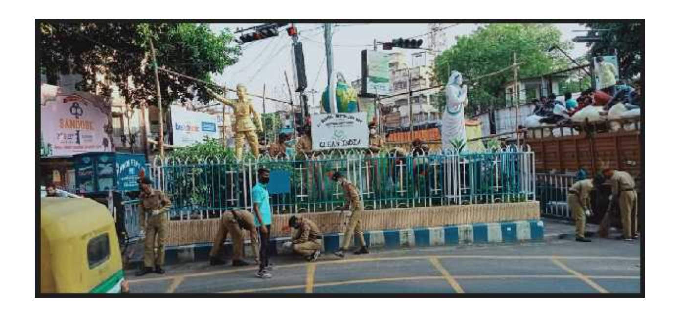
Cleanliness Drive taken by Our Cadets on 20/11/2021