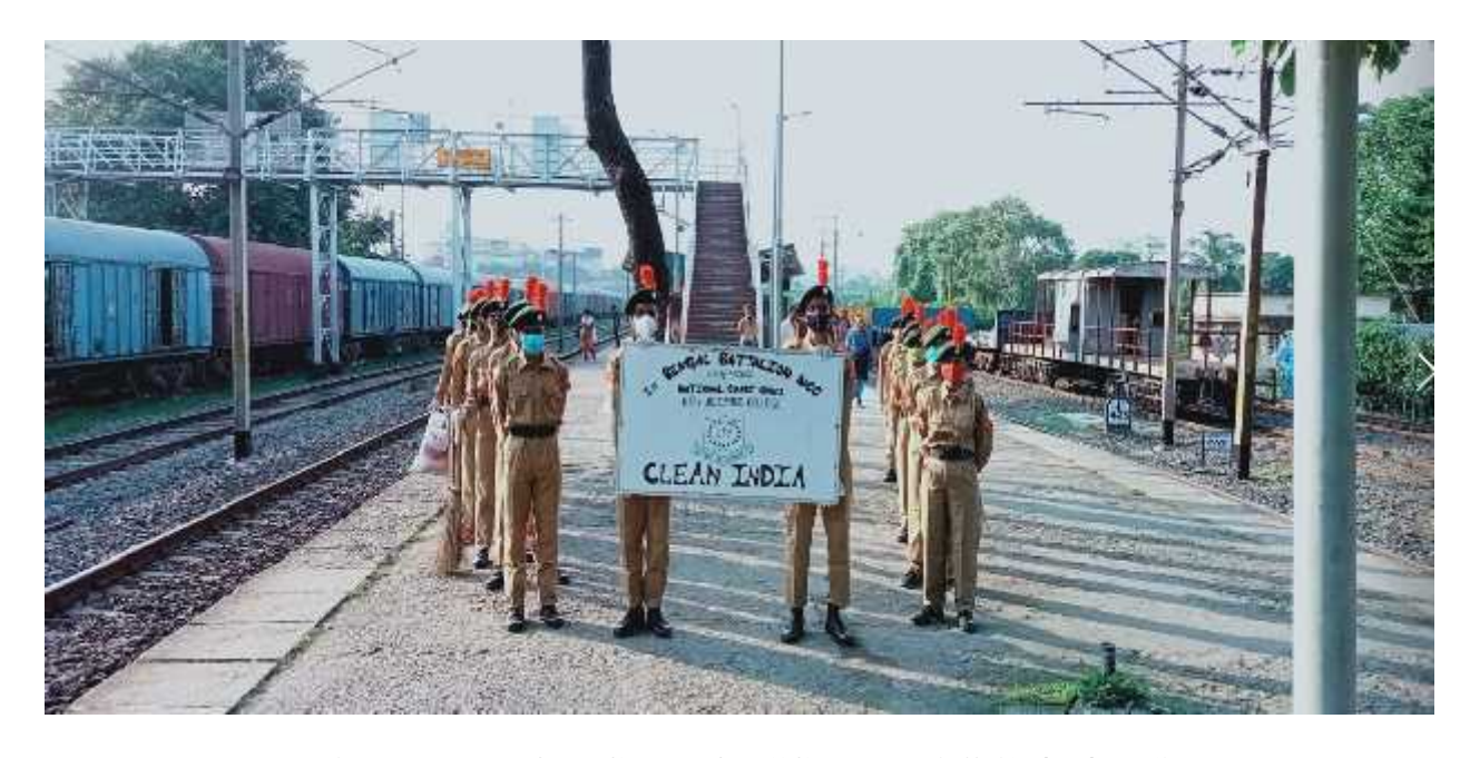
Drive taken by Our Cadets for "Clean India" (13/02/2021)