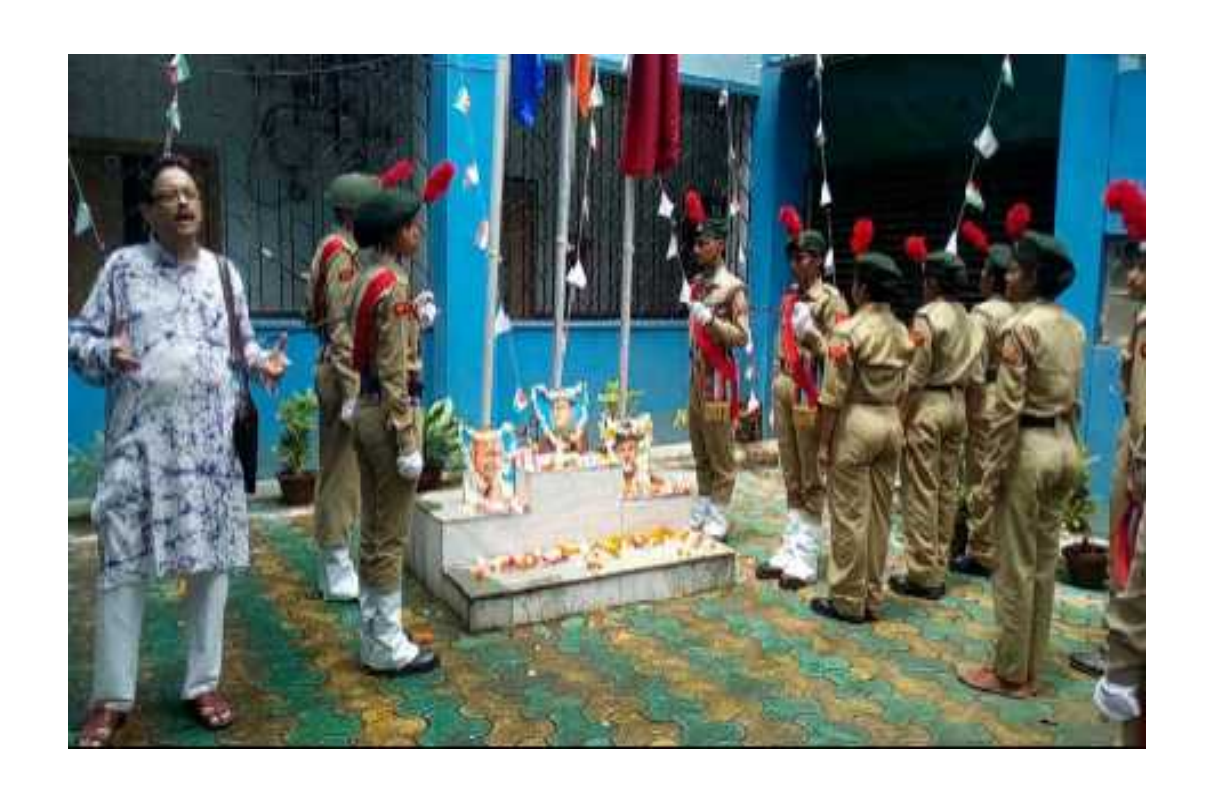
Celebration \ of \ Republic \ Day-2019