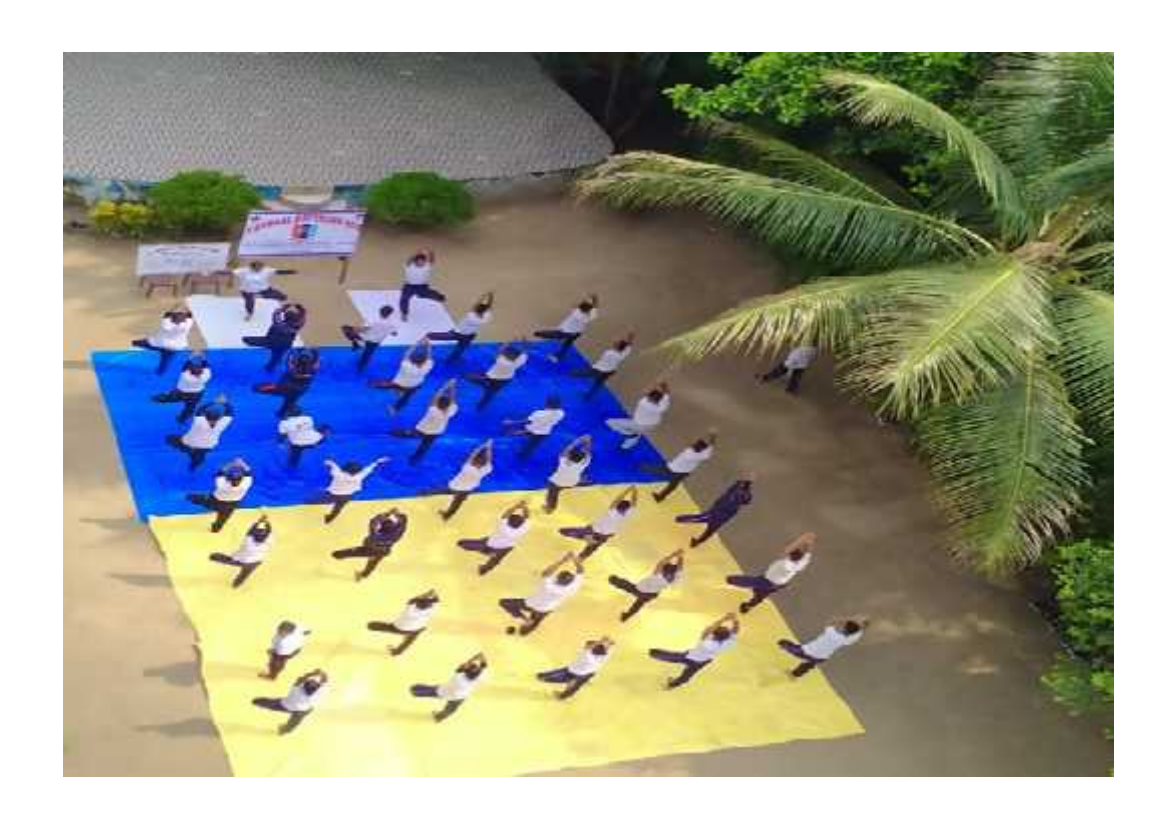
Celebration of International Yoga Day on 21st Juine'2022