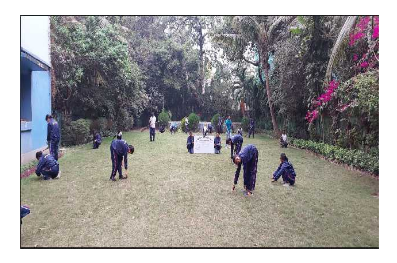
Cleanliness Programme Organised by Our Cadets on 27/07/2019