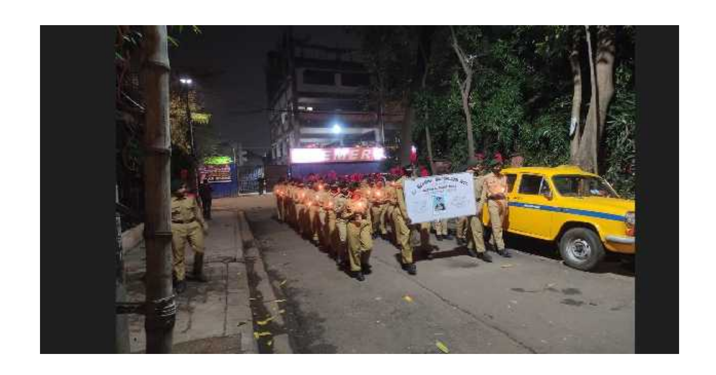
Rally for sad demises of "Chief of Defence Staff (CDS) General Bipin Rawat of the Indian Armed Forces"