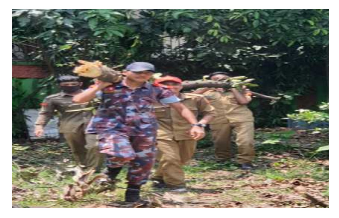
Cleanliness Drive taken by Our Cadets after AMPHAN CUCLONE in Kolkata (03/09/2020)