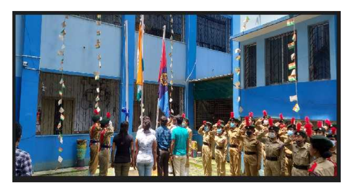
Celebration\ of\ Republic\ Day-2021