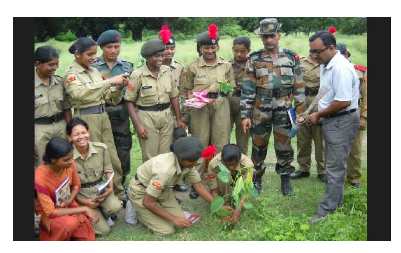
Celebration of Van Mahotsav on 05/07/2017