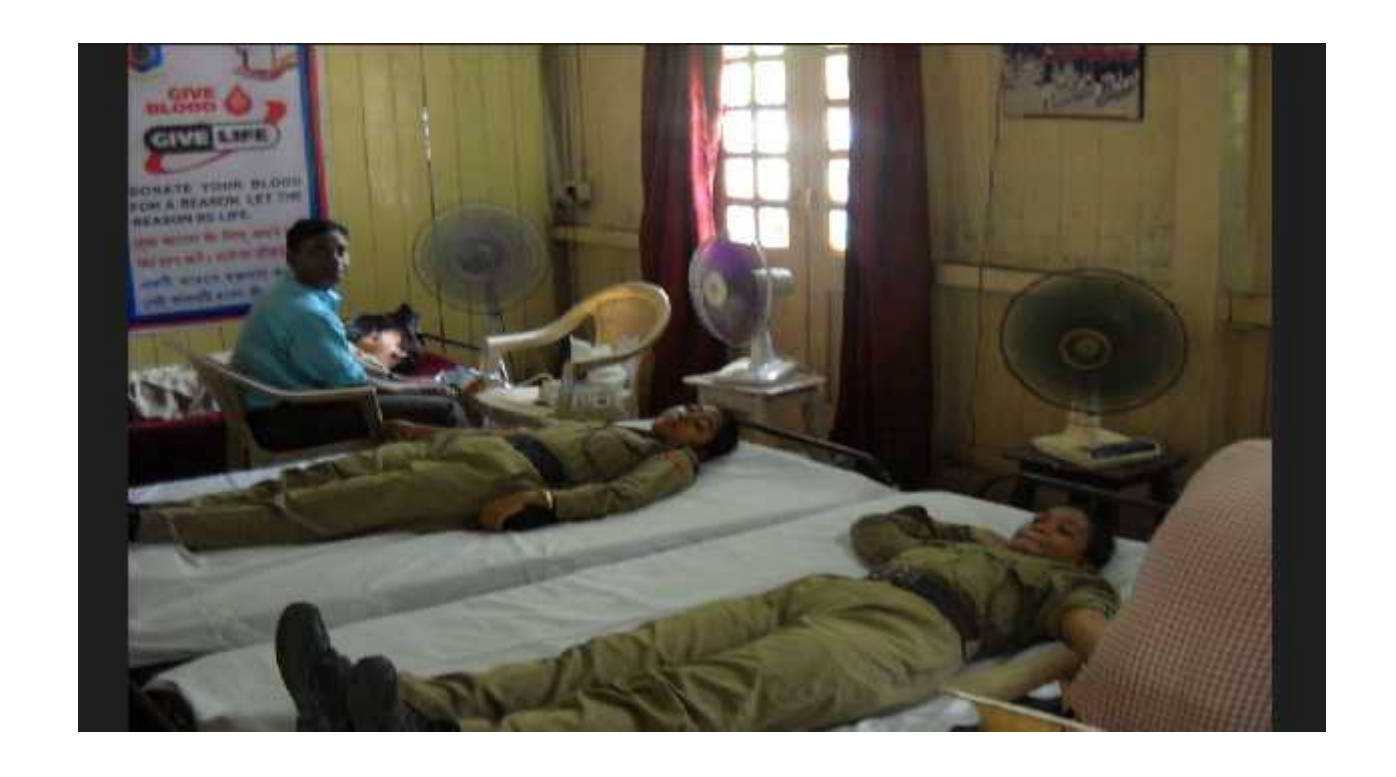
Some of our Cadets Donated Blood on 14/03/2020