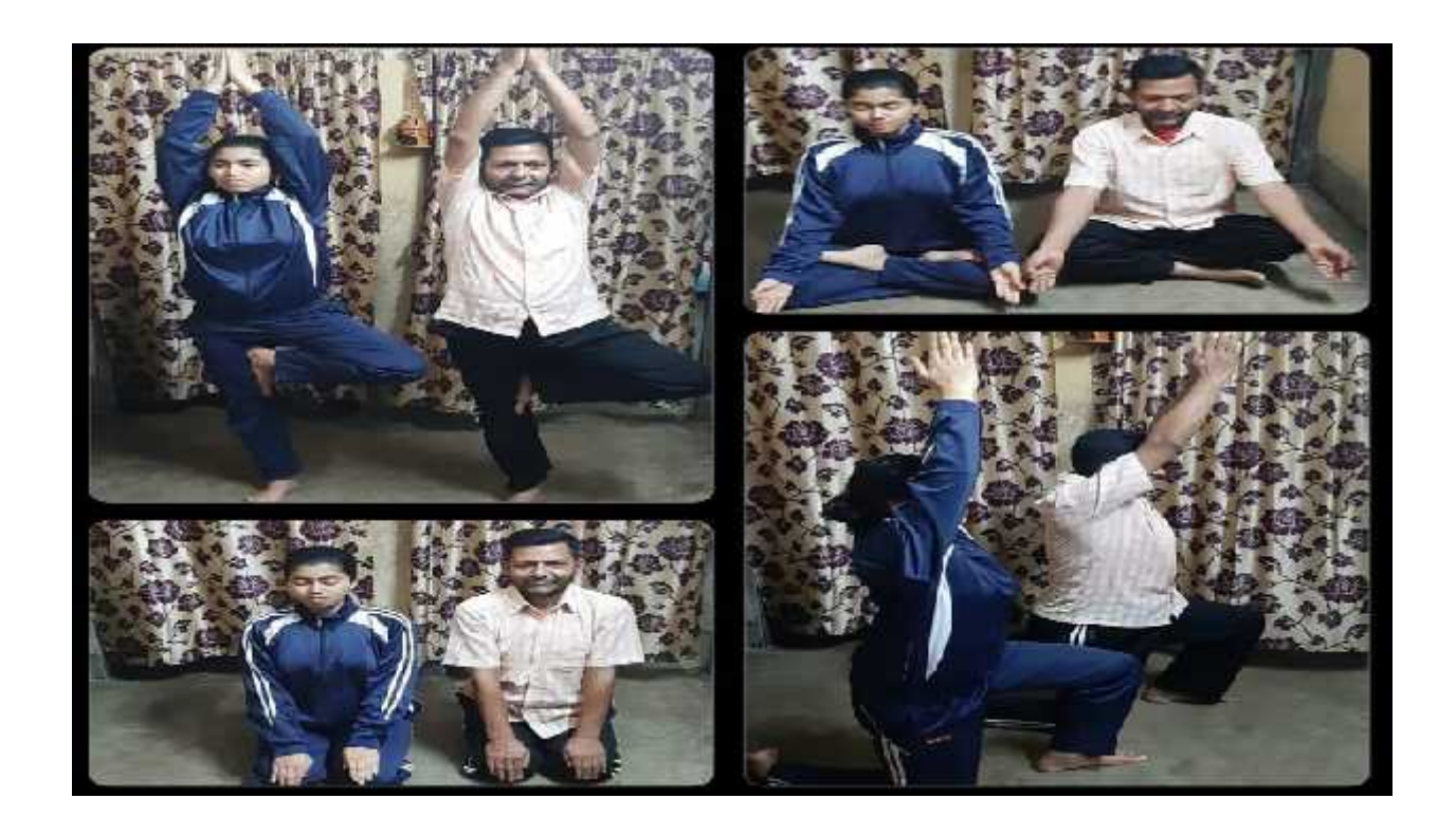
Celebration of International Yoga Day on 21<sup>st</sup> Juine'2021 (During COVID – 19 Pandemic)