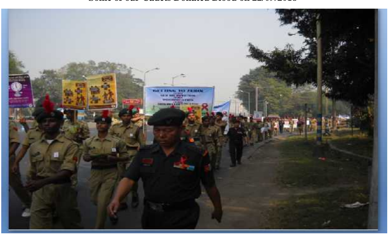
Our Cadets Participated to the Rally on World AID's Day (01/12/2018)