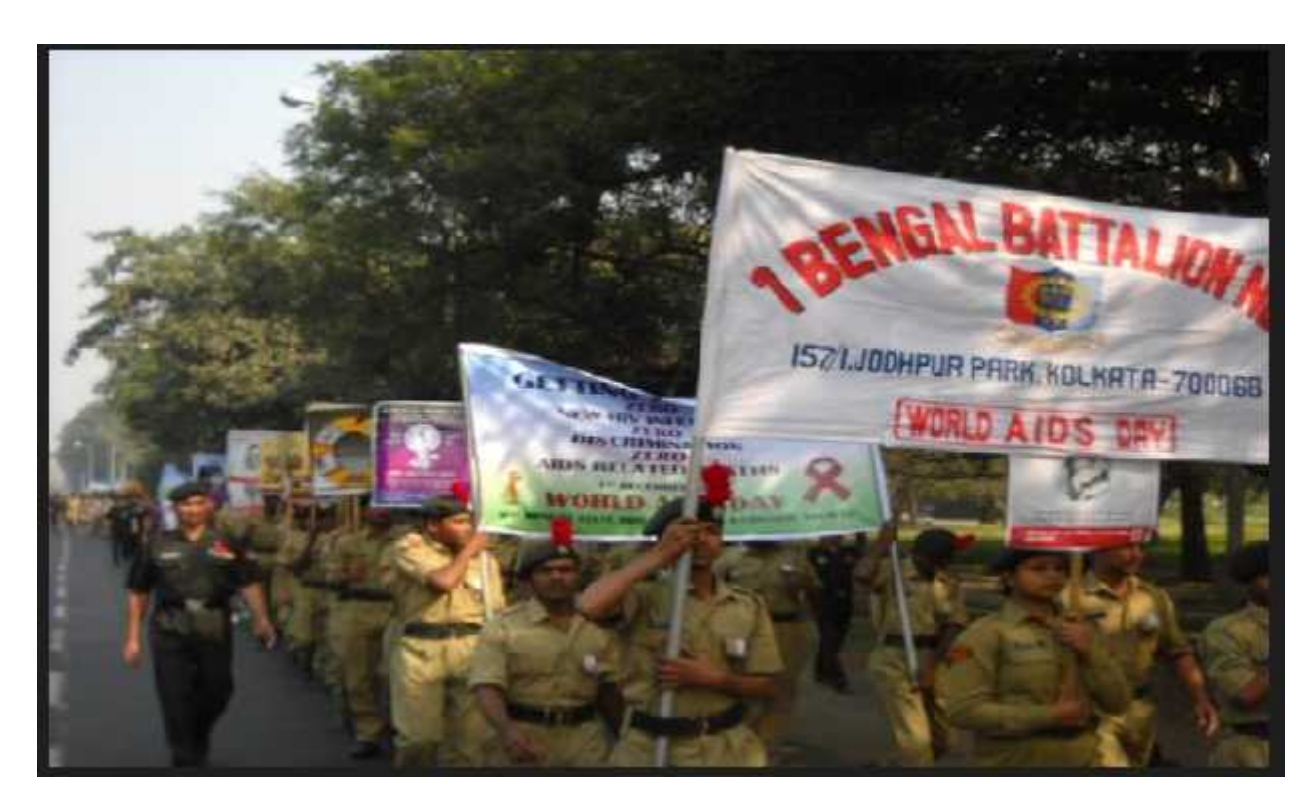
Our Cadets Participated to the Rally on World AID's Day (01/12/2017)