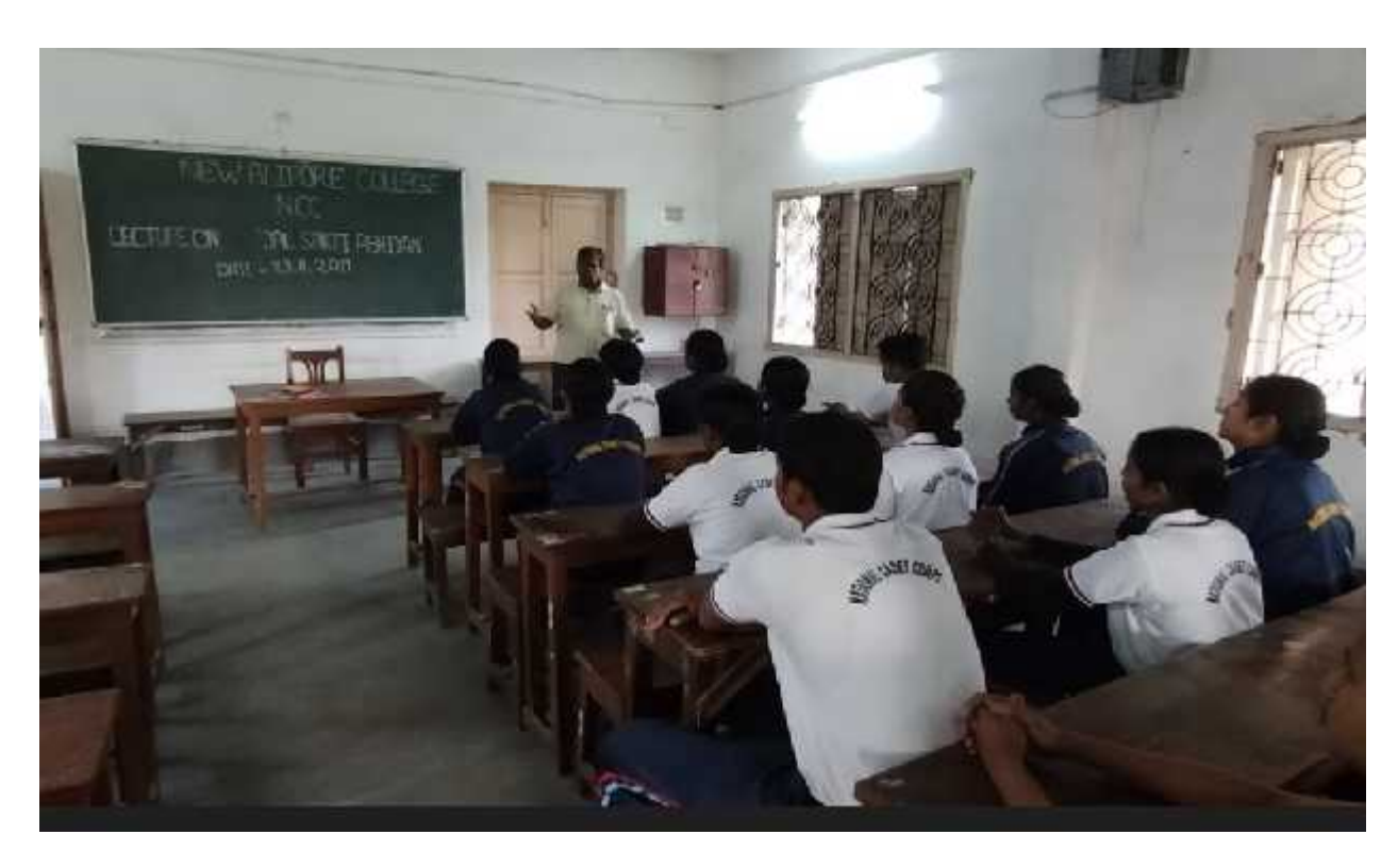
Motivation Lecture on JAL SAKTI ABHIYAN (23/11/2019)