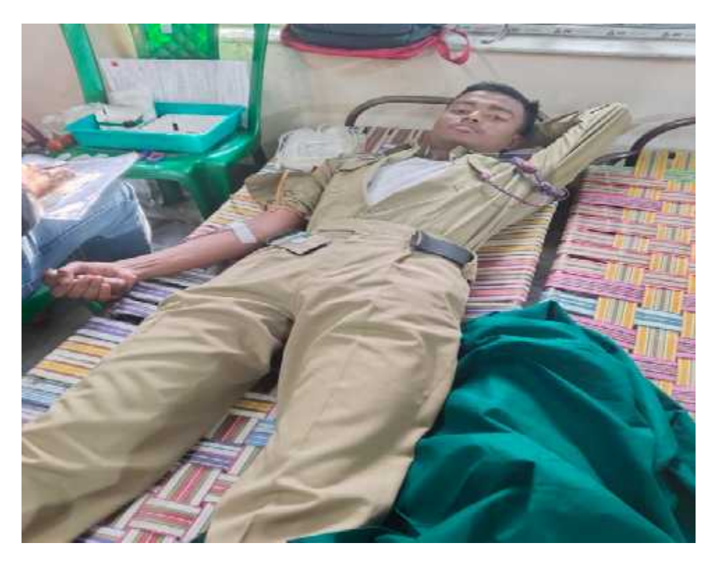
Some of our Cadets Donated Blood on 25/11/2017